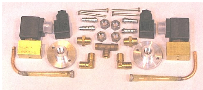
34-27346 for Volante / Twin tank

To order these or any other Heritage parts please contact one of our Heritage Specialists or Main Dealers, details of which can be found by following the link on the News page.